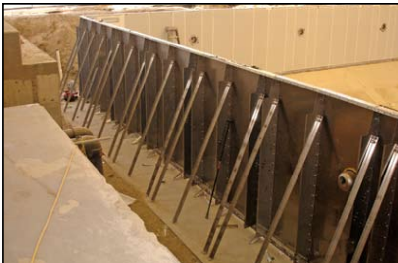
Figure 6: Stainless steel pool wall panels in place with partial supporting struts at deep end of pool.

Figures 2 and 3 (page 34) show the site after the original pool was removed and shoring was installed to support the building structure. Figures 4 and 5 (pages 34 and 35) show stages of footing and slab