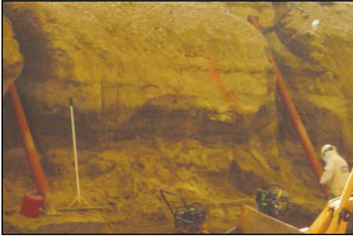
Figure 2: Building foundation shoring struts supported on concrete pads at deep end of pool, before placement of pool foundation forms and reinforcing.

Competitive bids were returned utilizing three types of construction: I) Shotcrete; II) Formed concrete; and III) Stainless steel wall panels. Since construction would take place inside the existing gymnasium building, which is supported on shallow foundations, the shotcrete option meant that, after the existing pool was removed and the building foundation shored, the area might have to be filled with compacted earth fill. The inner area would then be cut out and removed so that the shotcrete could be applied to the free-standing walls. This would require a very large volume of soil being brought in, and then being removed from the building.