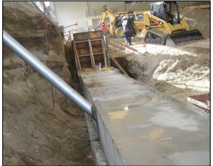
Figure 4: Footing poured, encasing base of shoring strut to be left in place.

When construction commenced, it was found that, after removal of the aluminum walls, the area between the pool and the building foundation was filled with uncompacted material. This material caved in, exposing the building footings on the south and east sides.