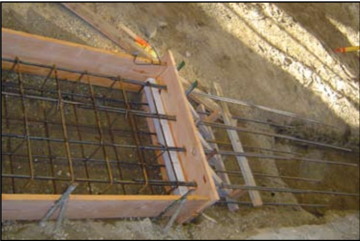
Figure 3: Footing reinforcing at step down to deep end of pool.

Both the stainless steel and the formed concrete wall options would require a minimum amount of excavation beyond the existing pool wall. However, as would be expected, the prefabricated steel wall panels would be more economical and take less time to construct, and this option resulted in the lowest bid. In addition, there was less disruption to the existing facility and less potential damage to the building due to installing a series of three-foot wide panels rather than constructing formwork, installing reinforcing steel, and then stripping and removing formwork for the walls.